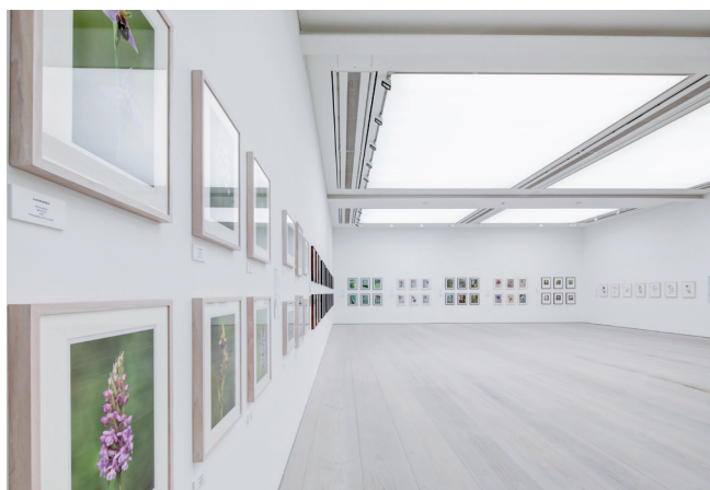
Botanical Art and Photography Show, Saatchi Gallery 2021

Botanical Art exhibits at the Botanical Art and Photography Show are staged across two galleries on the ground floor of the Saatchi Gallery in London. These are large bright rooms with white walls, pale wood floors and day light effect lighting.